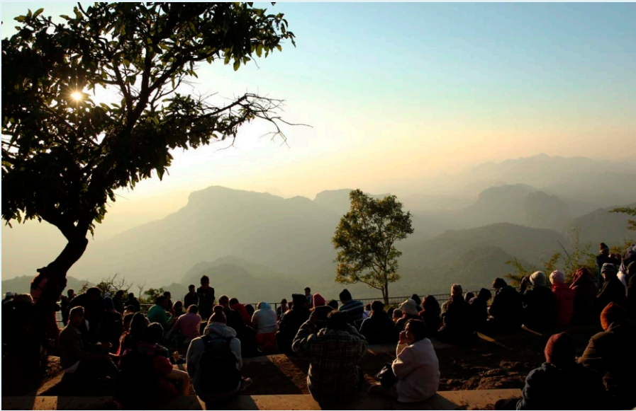
Green shades embrace the mountains of the Satpura ranges

P achmarhi is Madhya Pradesh's most verdant jewel, a place where nature has found exquisite expression in myriad enchanting ways.